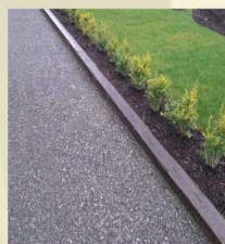
Slot 3 : Implementing the Standard Driveway To MS Guide