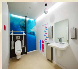
Slot 4 : Public Sanitation Issues For People With Disabilities