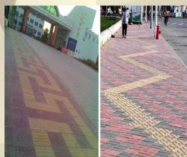
Slot 2 : Basic Tactile Guide And Implementation