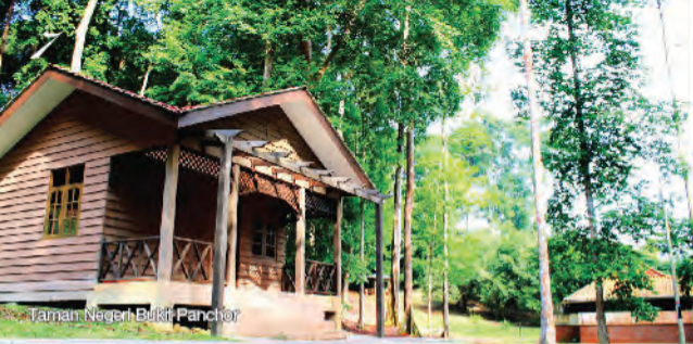
Taman Negeri Bukit Panchor