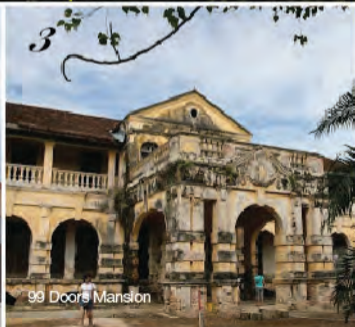
99 Doors Mansion