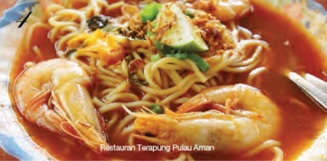
Restauran Terapung Pulau Aman