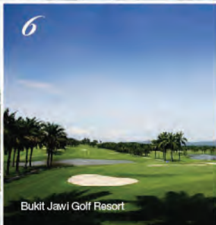
Bukit Jawi Golf Resort