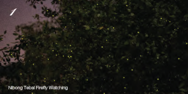
Nibong Tebal Firefly Watching