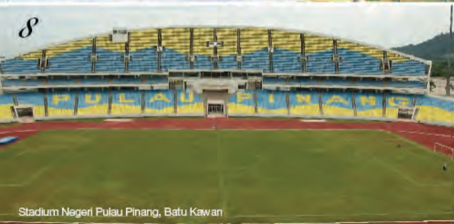
Stadium Negeri Pulau Pinang, Batu Kawan