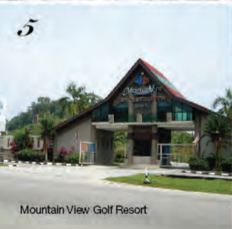
Mountain View Golf Resort