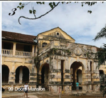
99 Doors Mansion