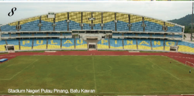
Stadium Negeri Pulau Pinang, Batu Kawan