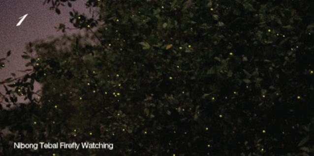
Nibong Tebal Firefly Watching