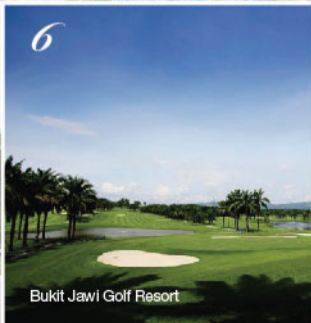
Bukit Jawi Golf Resort