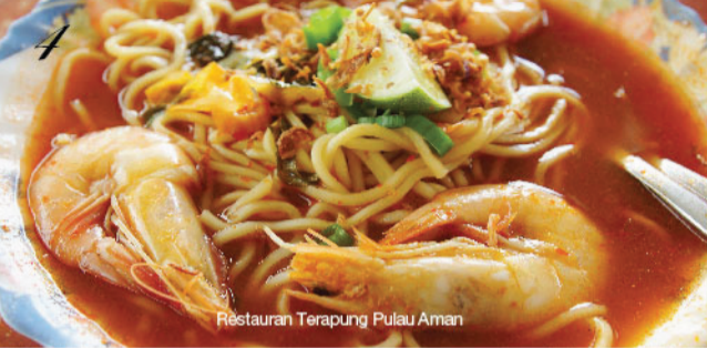
Restauran Terapung Pulau Aman