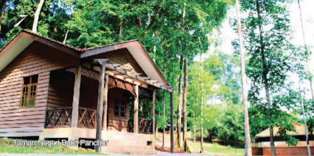
Taman Negeri Bukit Panchor