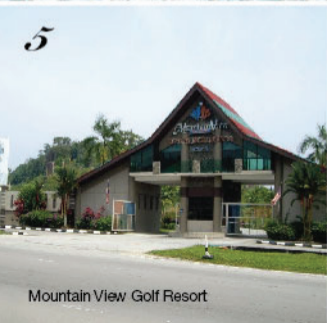
Mountain View Golf Resort