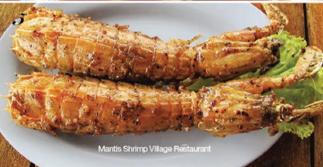
Mantis Shrimp Village Restaurant