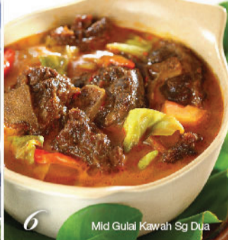
Mid Gulai Kawah Sg Dua