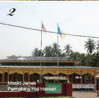
Masjid Jamek Permatang Haji Hassan