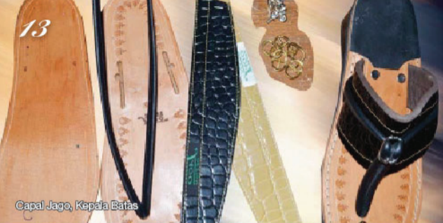
13 Capal Jago, Kepala Batas