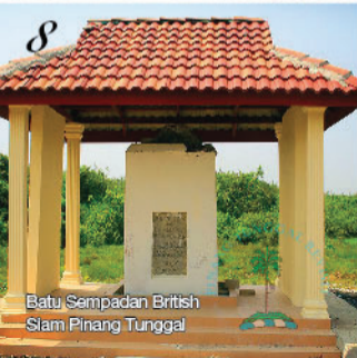
Batu Sempadan British Siam Pinang Tunggal