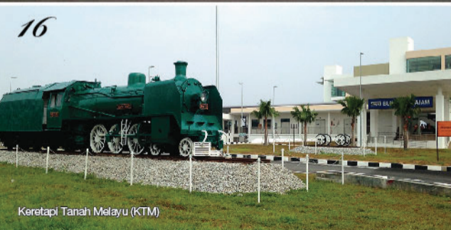
Keretapi Tanah Melayu (KTM)