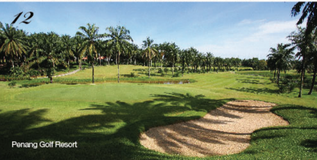
Penang Golf Resort