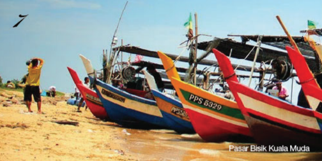
Pasar Bisik Kuala Muda