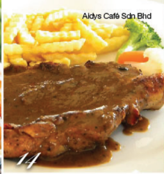
Aidys Café Sdn Bhd