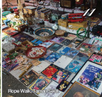
Rope Walk, Taman Selat