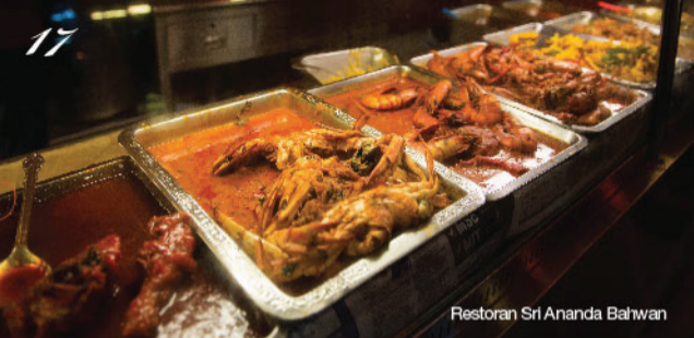
Restoran Sri Ananda Bahwan