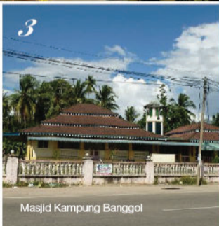
Masjid Kampung Banggol