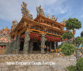
Nine Emperor Gods Temple