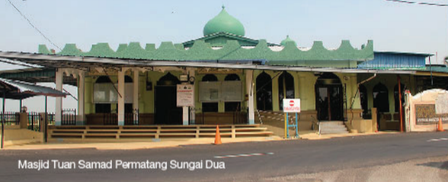
Masjid Tuan Samad Permatang Sungai Dua