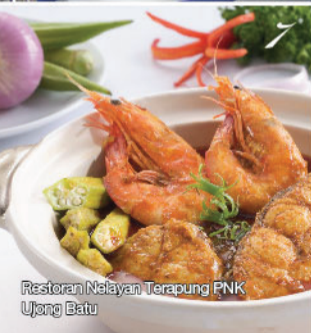
Restoran Nelayan Terapung PNK Ujong Batu