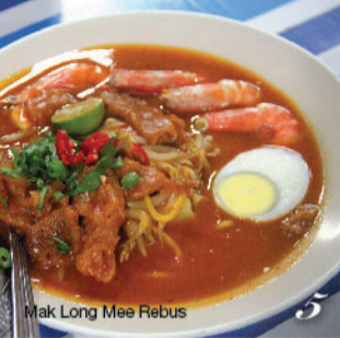
Mak Long Mee Rebus