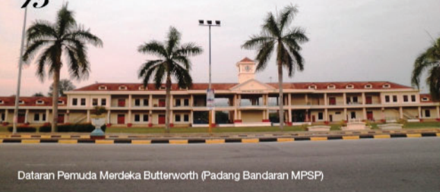
Dataran Pemuda Merdeka Butterworth (Padang Bandaran MPSP)