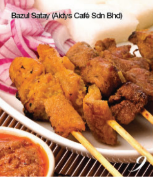
Bazul Satay (Aidys Café Sdn Bhd)