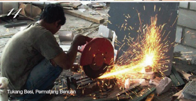
14 Tukang Besi, Permatang Benuan