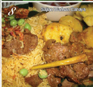
Sajian Warisan Cahaya