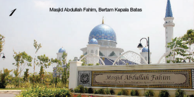
Masjid Abdullah Fahim, Bertam Kepala Batas