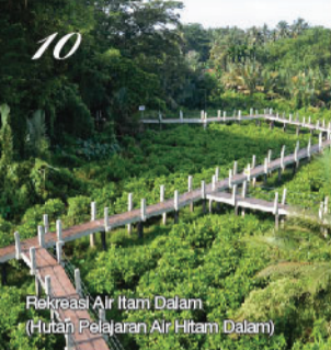
Rekreasi Air Hitam Dalam (Hutan Pelajaran Air Hitam Dalam)