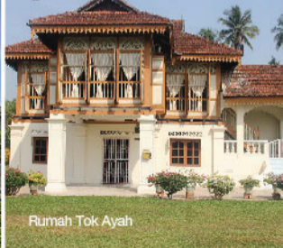
Rumah Tok Ayah