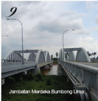
Jambatan Merdeka Bumbong Lima