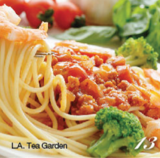
L.A. Tea Garden