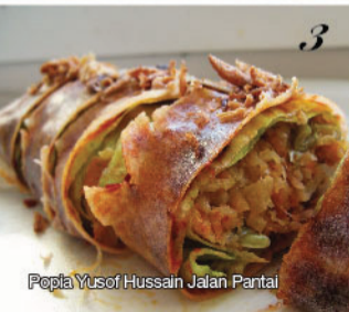
Popia Yusof Hussain Jalan Pantai